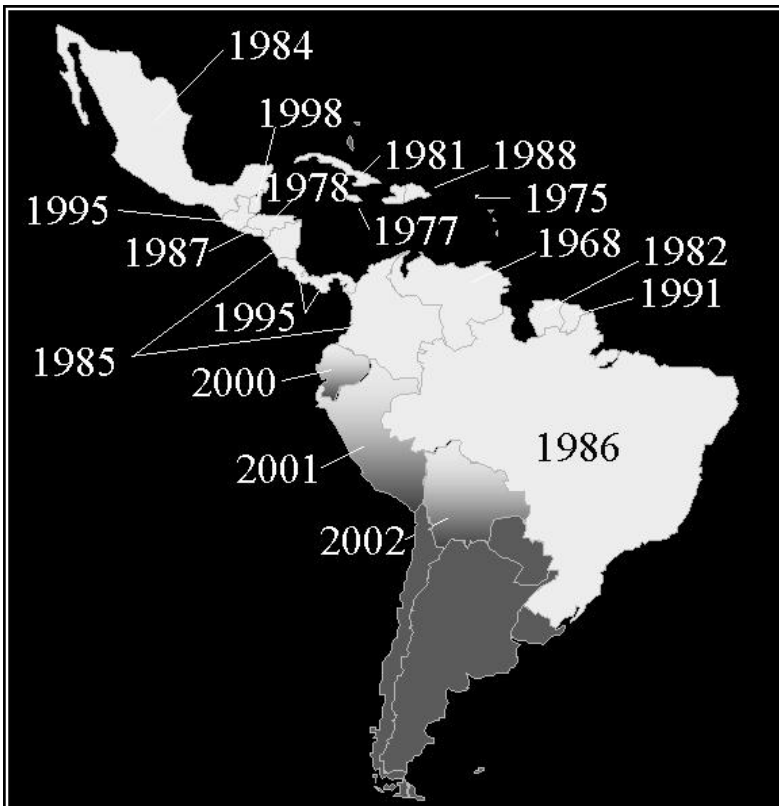
Figure 2: The Evolution of DHF